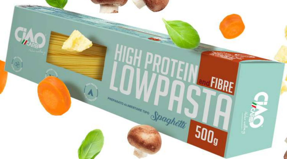
paper box + transparent film 500g