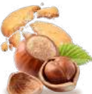
hazelnuts with cookie grains SP4401